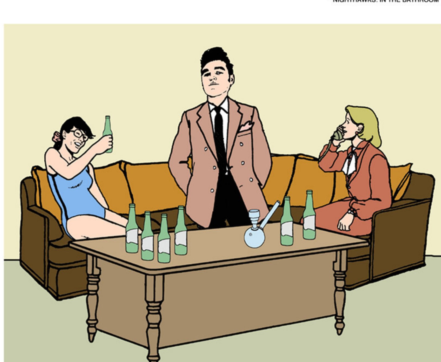
"FORTUNATE TEENS PARTY WITH MORRISSEY, 1994"