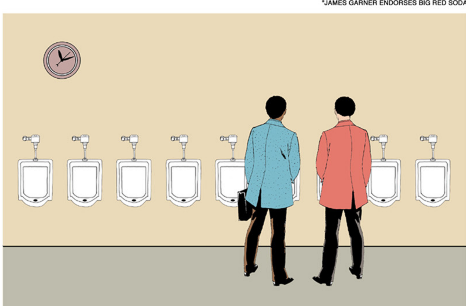
"NIGHTHAWKS: IN THE BATHROOM"