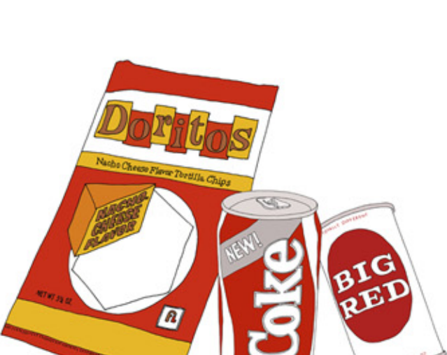
"STILL LIFE WITH OLD SNACKS"