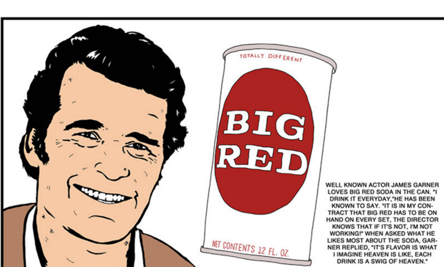
"JAMES GARNER ENDORSES BIG RED SODA"